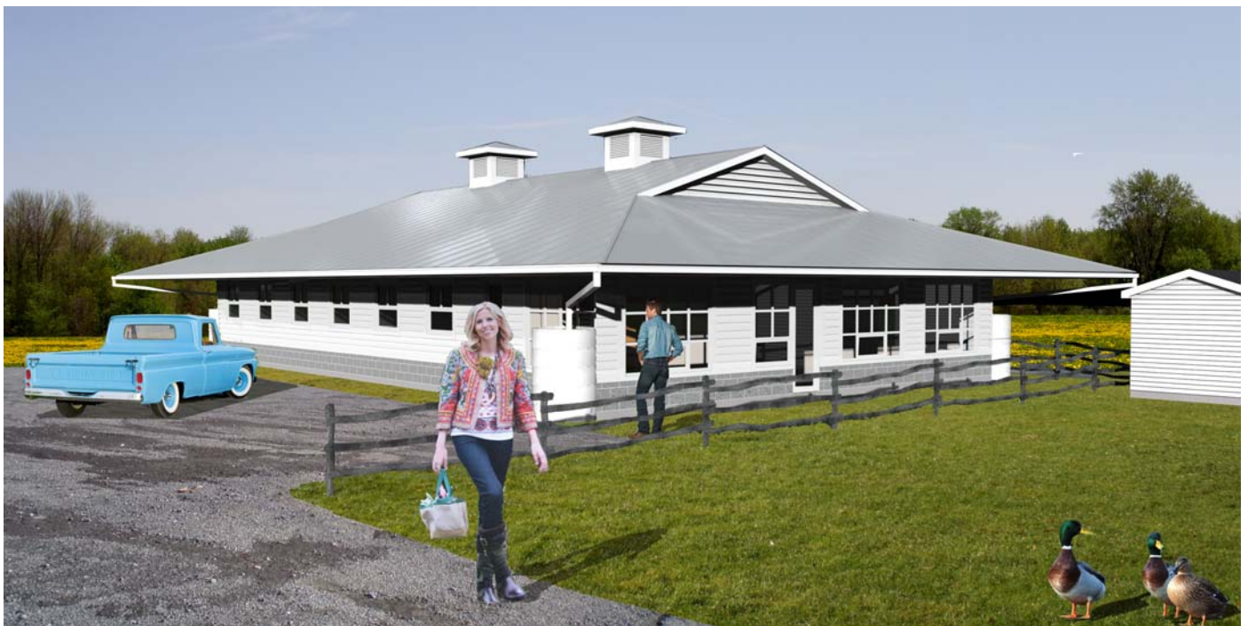
Our volunteer architect's depiction of the new clinic